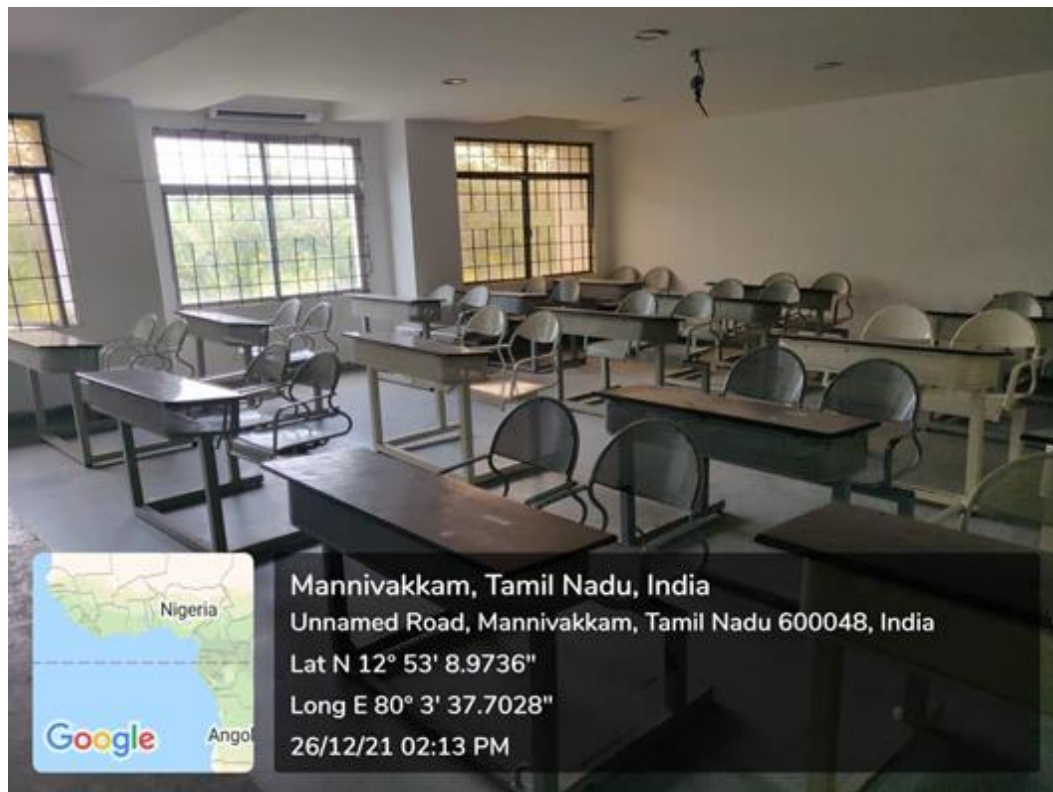
Reference Air Conditioned Class Room